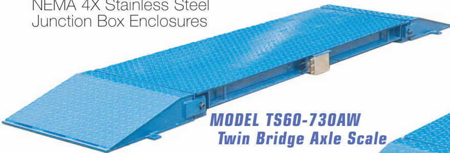
MODEL TS60-730AW Twin Bridge Axle Scale