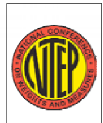
NTEP approved COC# 11-079