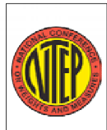
NTEP approved COC# 11-079