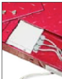
Top-access to pre-wired junction box