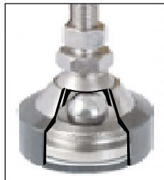
Precision ball and cup feet minimize side load shocks