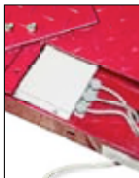
Top-access to pre-wired junction box