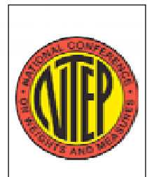
NTEP approved COC# 11-079