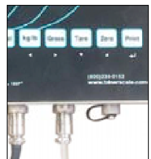
Connects to PC via RS-232 port on TS-700 MS, SS, or WB