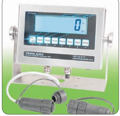
TS-700 SS digital indicator, featuring NEMA 4X stainless steel enclosure and batterv